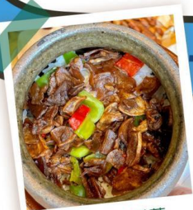
昆明老街推薦 野生菌燜飯 FASHIONABLE TRAVEL