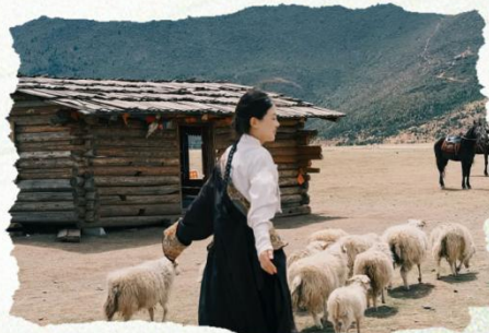
Napa Lake Tibetan Costume Exchange 納帕海/換裝旅拍