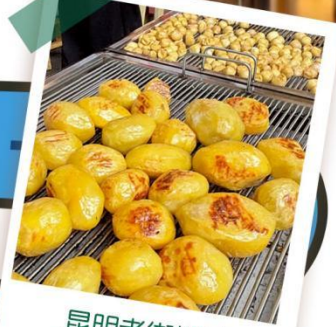
昆明老街推薦 燒洋芋，燒豆腐 FASHIONABLE TRAVEL