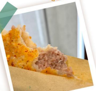
大理推薦 清真肉餅 FASHIONABLE TRAVEL