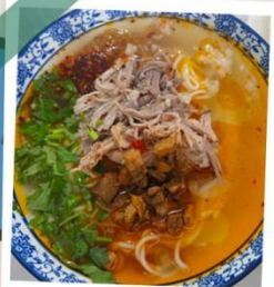
大理古城推薦 耙肉餌絲 FASHIONABLE TRAVEL