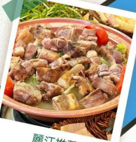
麗江推薦 麗江臘排骨 FASHIONABLE TRAVEL