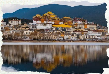
Ganden Sumtseling Monastery 噶丹鬆贊林寺