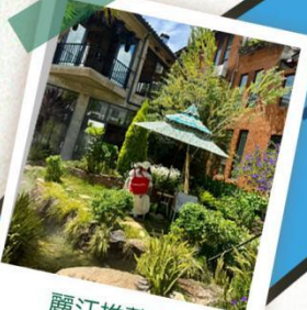
麗江推薦打卡 束河廢墟餐廳 FASHIONABLE TRAVEL