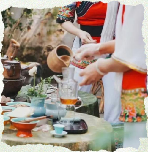
Santorini Ideal Land (Complimentary afternoon tea included) 聖托裏尼理想邦下午茶