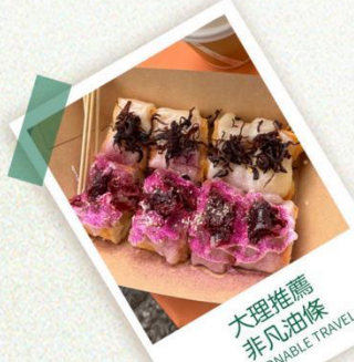
大理推薦 非凡油條 FASHIONABLE TRAVEL