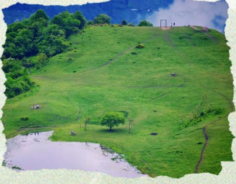
Ganhai Grassland 甘海子