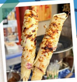
大理古城推薦 烤乳扇 FASHIONABLE TRAVEL