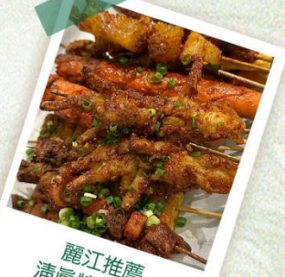
麗江推薦 清真特色燒烤 FASHIONABLE TRAVEL