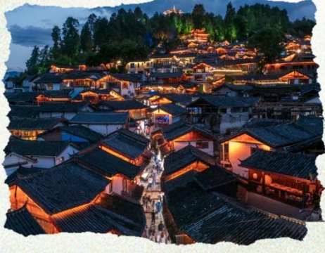
night view of Lijiang Ancient Town 麗江古城夜景