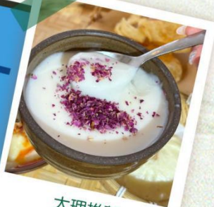
大理推薦 鮮奶米布 FASHIONABLE TRAVEL