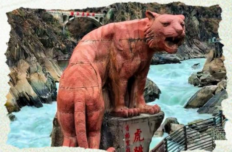
Tiger Leaping Gorge 虎跳峽