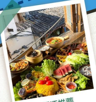
麗江推薦 七彩手抓飯 FASHIONABLE TRAVEL