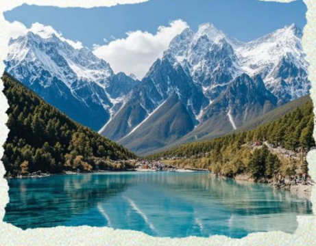
Blue Moon Valley 藍月谷