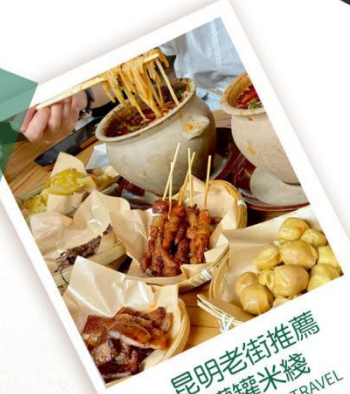
昆明老街推薦 罐罐米綫 FASHIONABLE TRAVEL