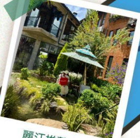
麗江推薦打卡 束河廢墟餐廳 FASHIONABLE TRAVEL