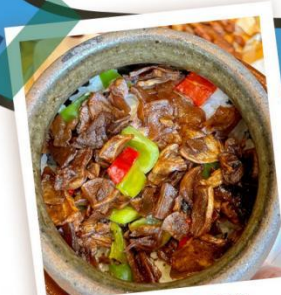
昆明老街推薦 野生菌燜飯 FASHIONABLE TRAVEL