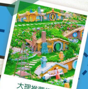
大理推薦打卡 霍比特城堡 FASHIONABLE TRAVEL