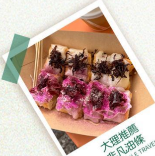
大理推薦 非凡油條 FASHIONABLE TRAVEL