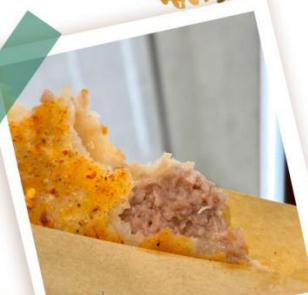
大理推薦 清真肉餅 FASHIONABLE TRAVEL