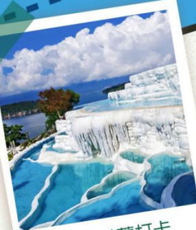
麗江推薦打卡 白水臺 FASHIONABLE TRAVEL