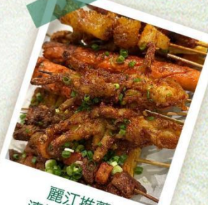
麗江推薦 清真特色燒烤 FASHIONABLE TRAVEL