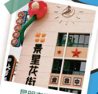
昆明老街推薦 景星花街 FASHIONABLE TRAVEL