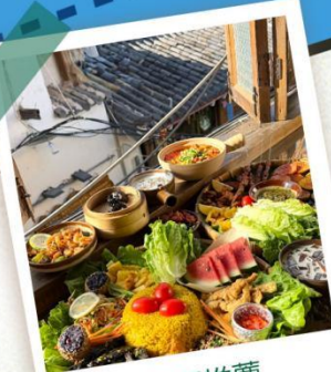
麗江推薦 七彩手抓飯 FASHIONABLE TRAVEL