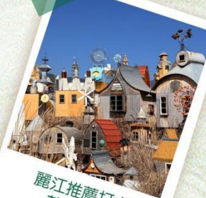
麗江推薦打卡 荒野之國 FASHIONABLE TRAVEL