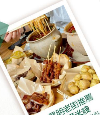
昆明老街推薦 罐罐米綫 FASHIONABLE TRAVEL