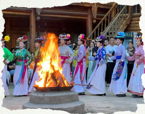
Mosou Bonfire Party 摩梭篝火晚會