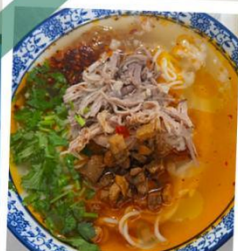
大理古城推薦 耙肉餌絲 FASHIONABLE TRAVEL