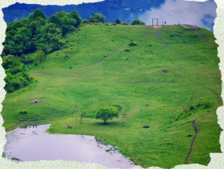
Ganhai Grassland 甘海子