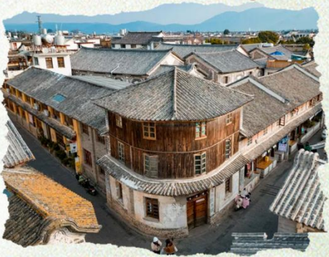
Xizhou Ancient Town 喜洲古鎮