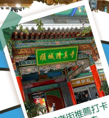
昆明老街推薦打卡 順城清真寺 FASHIONABLE TRAVEL