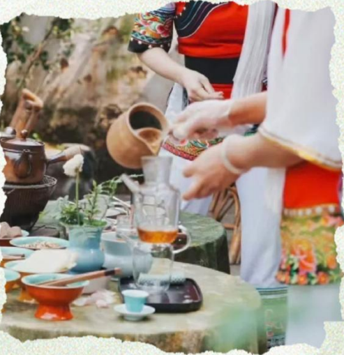
Santorini Ideal Land (Complimentary afternoon tea included) 聖托裏尼理想邦下午茶