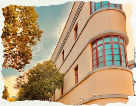
Kunming Old Street 昆明老街