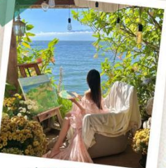
大理推薦打卡 愛麗絲仙境花園 FASHIONABLE TRAVEL