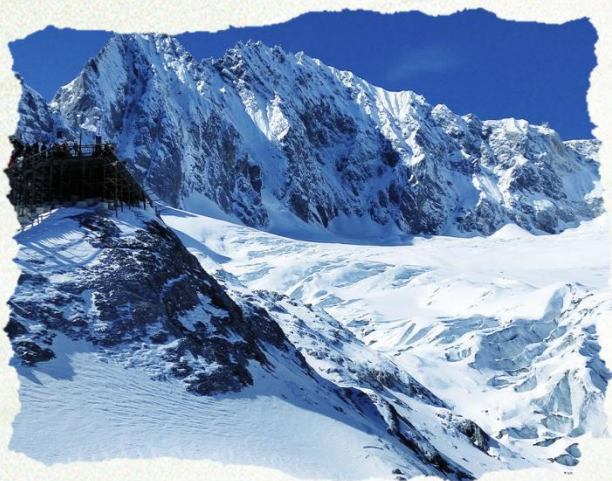
Jade Dragon Snow Mountain Glacier Grand Cableway 玉龍雪山·冰川大索道