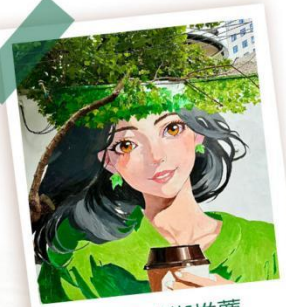
昆明老街推薦 “巡津”藝術牆 FASHIONABLE TRAVEL