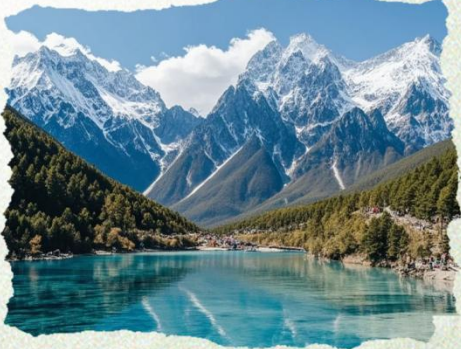
Blue Moon Valley 藍月谷