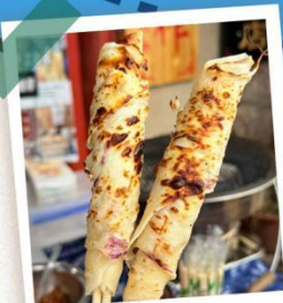
大理古城推薦 烤乳扇 FASHIONABLE TRAVEL