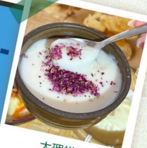
大理推薦 鮮奶米布 FASHIONABLE TRAVEL