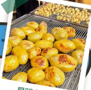
昆明老街推薦 燒洋芋，燒豆腐 FASHIONABLE TRAVEL