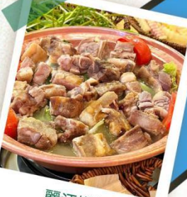
麗江推薦 麗江臘排骨 FASHIONABLE TRAVEL