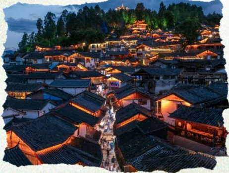
night view of Lijiang Ancient Town 麗江古城夜景