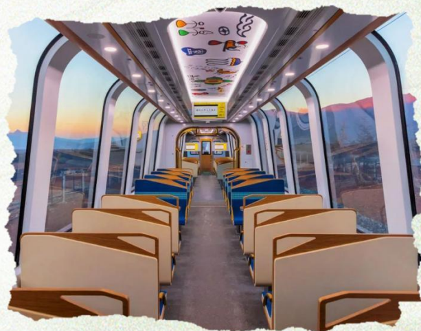
Snow Mountain Sightseeing Train 雪山觀光列車（單程）