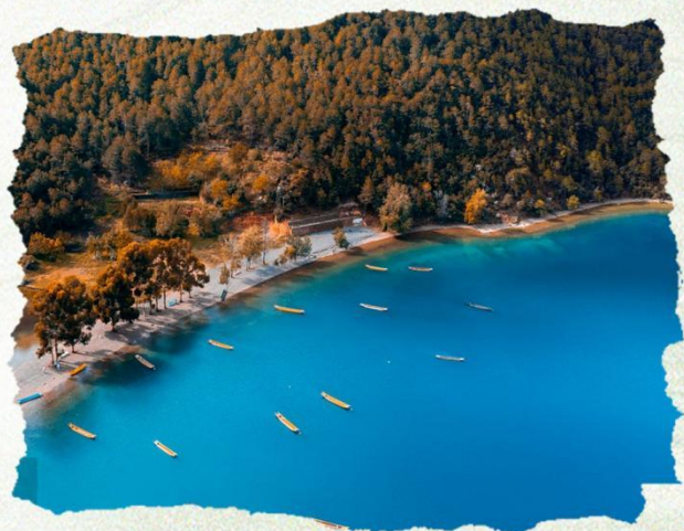
Take a boat tour on the lake 豬槽船游湖