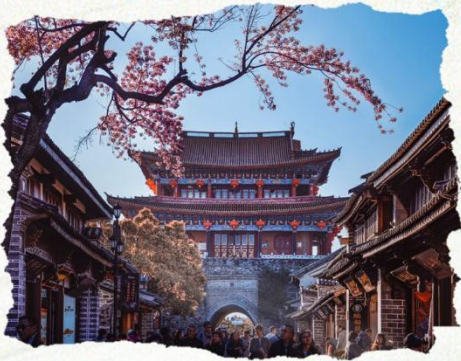
Dali Ancient Town 大理古城